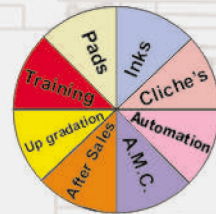
The complete solution from Rita Pad